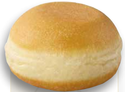
Berliner with filling, plain