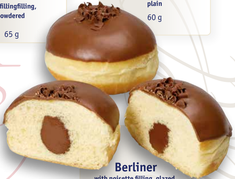
Berliner with noisette filling, glazed, decorated with chocolate curls