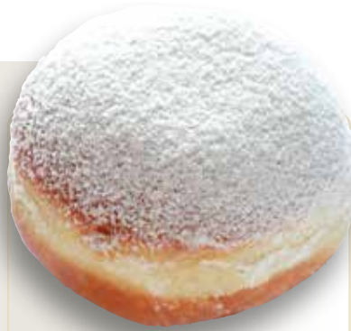
Berliner with filling, filling, powdered