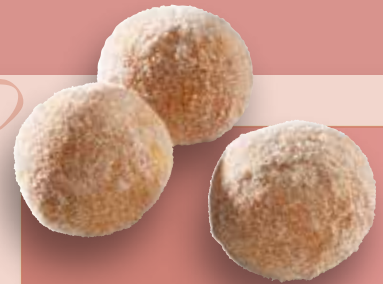
Mini buttermilk balls with sugar

Art. No. 52303 | approx. 18 g approx. 112 pieces/box